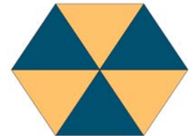
Diagram 5 Make 20