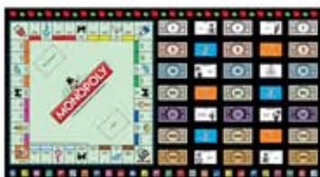
20899 J 2 panels