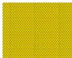
20904 S 1 yd