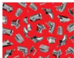
21017 R 2 3 / 8 yds