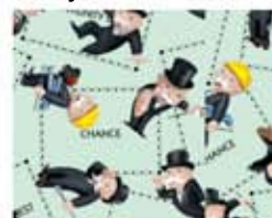
20901 Q 3/8 yd