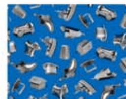
21017 B 3/8 yd