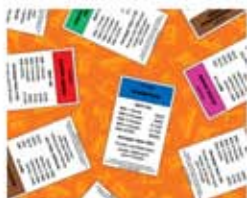
21013 O 1/4 yd