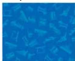
21012 B 1 1/2 yds