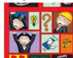
20900 R 4 yds