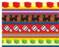
20905 S 3/4 yd